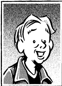
SKIP KLASS STUDENT INACTIVIST

"It means a one-day reprieve from Back to School."