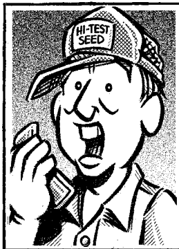
JUSTIN TYME ABOUT-TO-BE DAD

"It means I've gotta run! Th' wife is havin' a baby!"