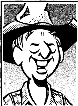
E.Z. GOHING Unflappable Guy

“I wanna buy a 55-inch TV, but stores sellin’ ’em won’t be open!”