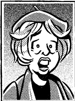
IMA INDETT Financial Whiz

“I also want a big TV, but my rent and bills are overdue!”